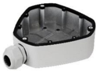
DS-1280ZJ-DM25 Junction Box