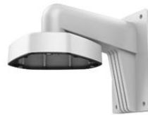
DS-1273ZJ-DM25 Wall Mount