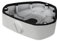
DS-1281ZJ-DM25 Inclined Ceiling Mount