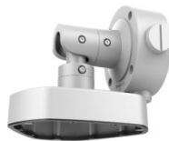
DS-1283ZJ Wall Mount (3-axis Adjustment)